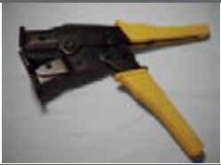
A) Tape Splicer Tool