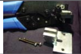
D) Mounting Adapter Flange