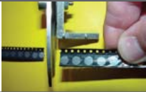
C) Tool Carrier Cutting