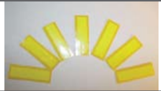
Splicing Tapes & Extenders